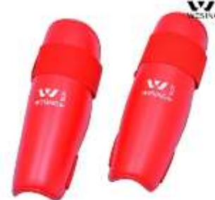
Shin Guard Class A-C