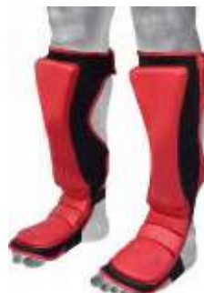
Shin and Instep Guards Class C-E