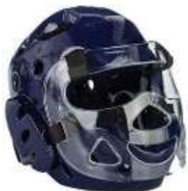
Head Protector with Face Shield Class C-F

Depending on Class other equipment may include: