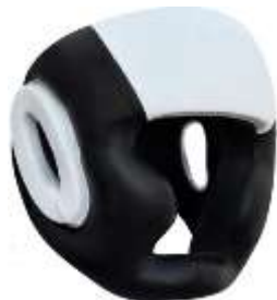
Head Protector with Raised Cheek Class B